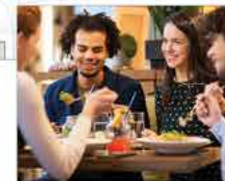
The Craft Center will be located directly above the neighborhood's main dining hall.