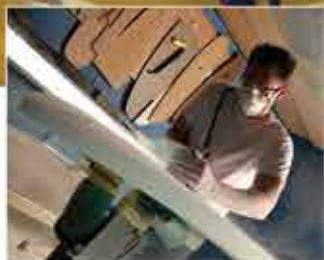
Local expert board-builders will guide classes in surfboard shaping, from blank to glassing.