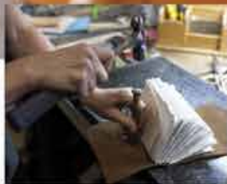
Book arts classes will give participants the chance to bring words to life.

The reimagined Craft Center is designed for year-over-year financial sustainability, with a nimble business model that makes the most of cross-campus efficiencies.