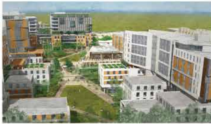
The neighborhood's new Craft Center and mixed-use community building will be a centrally located and highly visible heart and hub for expression, creation, and passion.

With a gift to the Campaign for UC San Diego, you make the Craft Center a renewed possibility, enhancing experience in the North Torrey Pines Living and Learning Neighborhood. You will help our students, staff, faculty, and friends pursue new interests and build lasting bonds. The North Torrey Pines Craft Center perfectly represents a signal Campaign goal of enriching our campus community. With your support, you assure our collective success.