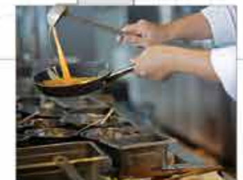
Specialized cooking classes will be offered, ranging from the basics to more advanced techniques.