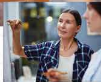
Art educators will teach classes for all ages and skill levels across a spectrum of media.