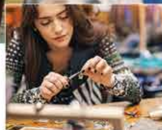
Students will learn how to plan and execute their own jewelry designs.

The new reenvisioned Craft Center will commingle student and community members in a collaborative, open place for experimentation, imagination, and craftsmanship.