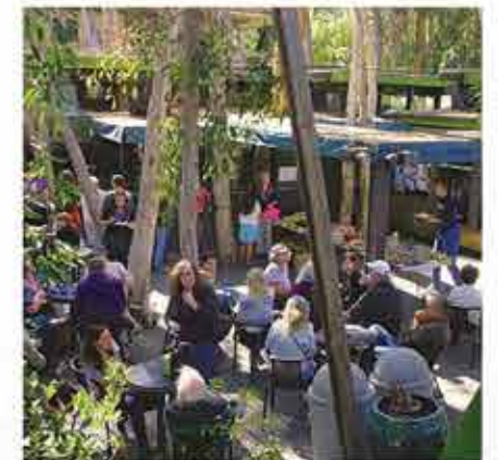
Located in the heart of the old Student Center, the original Craft Center was a community hub for creative expression.

events, footsteps away from dining and entertainment. Direct access to parking and the nearby trolley stop connect this space to our community, and our neighbors, to an unprecedented degree. It'll bring back what we had before, and make possible the inclusion of so many others.